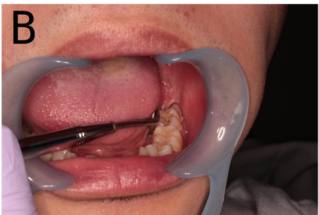
Figure 1. Preoperative intraoral view of the mandible. (A) Right wisdom teeth were horizontally impacted, and only a part of the crown was exposed; (B) Left wisdom teeth were horizontally impacted and only a part of the crown was exposed.