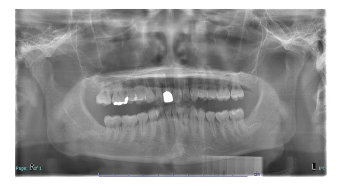
Figure 4. Postoperative panoramic radiographic examination, indicating successful removal of the lower third molar and antagonistic maxilla wisdom teeth. L, left; R, right.

mental and/or somatic disorders (28-30). However, the practice of safe and effective oral/dental medicine in patients