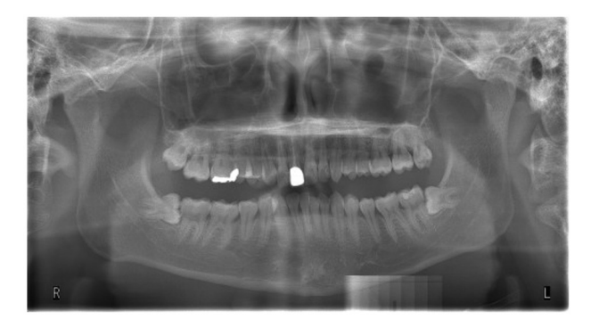
Figure 2. Preoperative panoramic radiographic examination findings. Bilateral maxillary wisdom distally had erupted, and bilateral mandibular wisdom was horizontally impacted. L, left; R, right.

acute respiratory syndrome coronavirus 2; and vii) although investigations revealed normal ECG and echocardiogram findings, the continuation of antipsychotic therapy, olanzapine, was evaluated in consultation with the attending psychiatrist to avoid side effects of drug interactions. The first stage involved removing the right mandibular wisdom tooth, the second stage involved removing the left mandibular wisdom tooth and the third stage involved removing the bilateral maxilla wisdom teeth. During and shortly after surgery, all the patient's vitals, including his level of consciousness, pulse rate, percutaneous oxygen saturation and blood pressure, were regularly monitored. To further reduce psychological stress, the patient's favorite music was played. Infection prevention involved 1,000 mg cefazolin sodium, administered intravenously 30 min before the operation and oral amoxicillin (250 mg) every 8 h for 3 days after the operation.