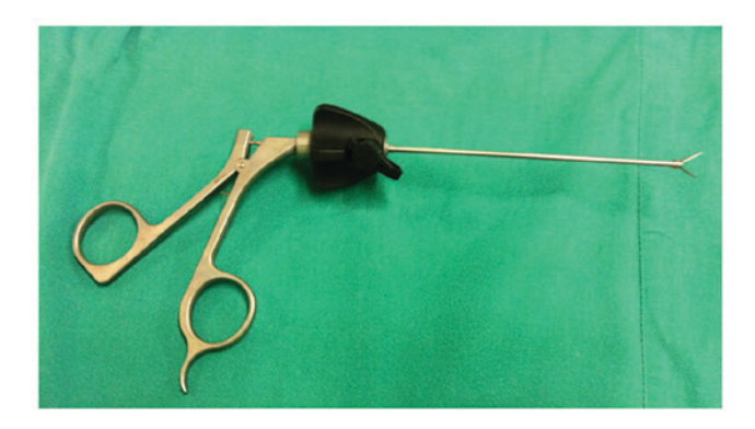
Figure 1. Miniature needle instrument.

group using needle instruments, there were 440 males and 68 females aged 1-11 years with the mean age of 4.32\pm1.62 years. Among them, there were 371 children with hernias on the right side and 137 children on the left side. In the traditional double-site group: There were 452 males and 50 females aged 1-11 aged years with the mean age of 4.46\pm1.34 years. Among them, there were 356 children with hernias on the right side and 146 children on the left side. All the children were diagnosed with unilateral inguinal hernias and received the herniorrhaphy for the first time. Parents signed the informed consent. All the children were followed up for 2 years. The study was approved by the Ethics Committee of Beijing Chao-Yang Hospital of Capital Medical University and informed consents were signed by the patients and/or guardians.