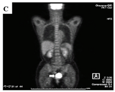
Figure 1. (A) Transvaginal ultrasonography revealed a mixed echogenic mass in the cervix. (B) Magnetic resonance imaging showed a hyperintense cervical mass invading the lower uterine segment. (C) Positron emission tomography-computed tomography revealed intense fluorodeoxyglucose activity correlating with the cervical and endometrial masses, without signs of metastasis to other organs or to the pelvic and para-aortic lymph nodes.

was 28 years old. The patient was 156 cm in height, weighed 51 kg, and had a body mass index of 20.95 kg/m². The history of menstrual cycles was regular and she had gone through menopause at the age of 51 years. The surgical history included an appendectomy at the age of 19 years, but there was no family history of cancer. The patient consulted a gynecologist with a main complaint of moderate genital bleeding. A 35x30-mm mass lesion, which bled easily, was detected in the cervix.