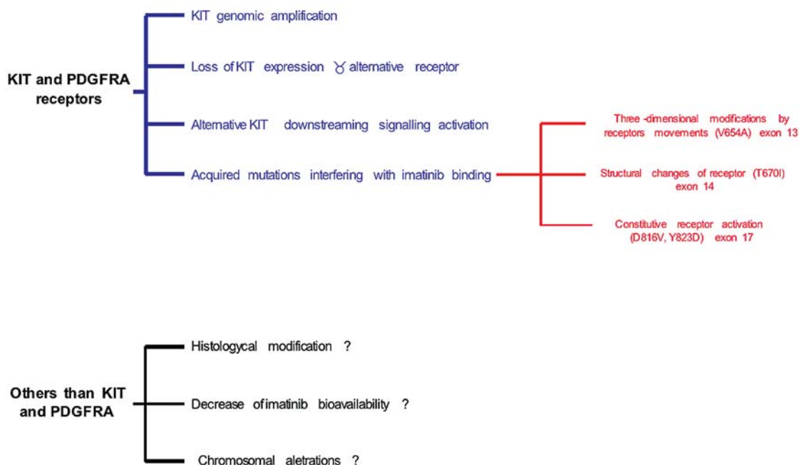
Figure 3. Main known mechanisms of secondary resistance to tyrosine kinase inhibitors in GISTs.

845-delDIMH842-845-, delRD841-842KN), exon 12 (delSPDGHE566-571-R, del560-564) exon 14 (N659K) (25).