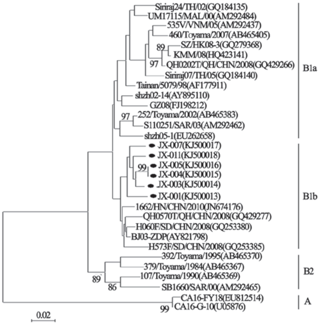
Figure 2. Phylogenetic trees constructed from CA16-positive specimen VP1 nucleotide sequences by the neighbor-joining method with 1,000 bootstrap replicates using MEGA5. The tree was based on a 378-base pair CA16 VP1 sequence (2785-3162 nucleotide, reference U05876). •Strains obtained in the study. CA16, coxsackievirus A16.

number of females and males was similar. With regards to age group, the highest percentages of CA16-infected patients were children between 1-3 years (89.4%, 202/226).