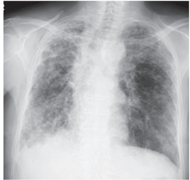
Figure 3. Chest radiograph 8 months after the autologous blood-patch pleurodesis shows no recurrence of pneumothorax.

PSS is a systemic disease that sometimes affects the lungs, resulting in lung fibrosis (1). Diffuse interstitial fibrosis is the most common pulmonary manifestation and pneumothorax is usually associated with the pulmonary complication of interstitial fibrosis (1). The underlying mechanism of pneumothorax is believed to result from the rupture of acquired subpleural cystic spaces associated with the diffuse interstitial fibrosis (2). In patients with PSS with interstitial fibrosis, the distinctive rigidity of lung parenchyma may prevent pre-expansion of the ruptured lung. Additionally, immunosuppressants including corticosteroids, which are frequently used for PSS, may aggravate persistent air leak;