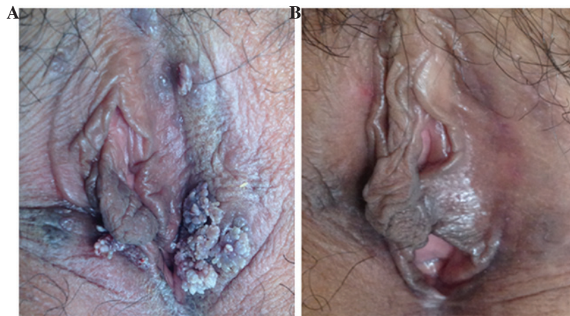
Figure 2. Lesions of case 2. (A) Prior to treatment and (B) after cryotherapy and treatment with proanthocyanidins.

At the 1-month follow-up, only 1 case of recurrence was identified, corresponding to a recurrence rate of 2.2%. At 3 months, 5 cases of recurrence were identified, and the recurrence rate was 10.9%. These results are summarized in Table I.