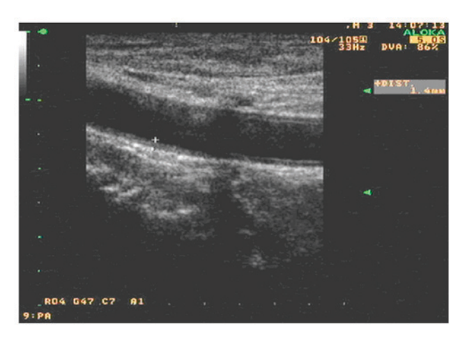
Figure 1. Carotid artery high resolution color Doppler ultrasonograph of a selected frame of a typical case prior to treatment.

Values are expressed as the mean \pm standard deviation. <sup>a</sup>P<0.01, compared with before treatment in the same group; <sup>b</sup>P<0.01, compared with control group; <sup>c</sup>P<0.05, compared with before treatment in the same group. TC, total cholesterol; TG, triglycerides.