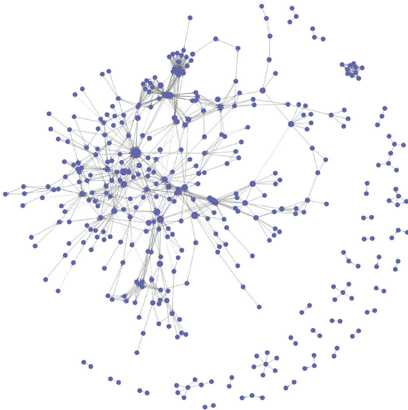
Figure 2. Gene signal network of common DEGs. The nodes and edges are common DEGs and their relationships, respectively. DEGs, differentially expressed genes.

confirmed to participate in agonist-mediated desensitization of G protein-coupled receptors and to induce the specific dampening of cell responses (18). In addition, ARRB2 was more highly expressed in the central nervous system, and also regulated the synaptic receptors (19). Additionally, shock, a common complication of major burn injuries, was found to be closely related to the regulation of receptors, sensitivity to neurotransmitters and non-synaptic transmission (20). Consistent with the results of the present study, ARRB2 was involved in signal transduction, platelet activation, as well as the chemokine and MAPK signaling pathways. Cytokine and chemokine of inflammatory response was the common response behavior for burn injury. Through a drug trial,