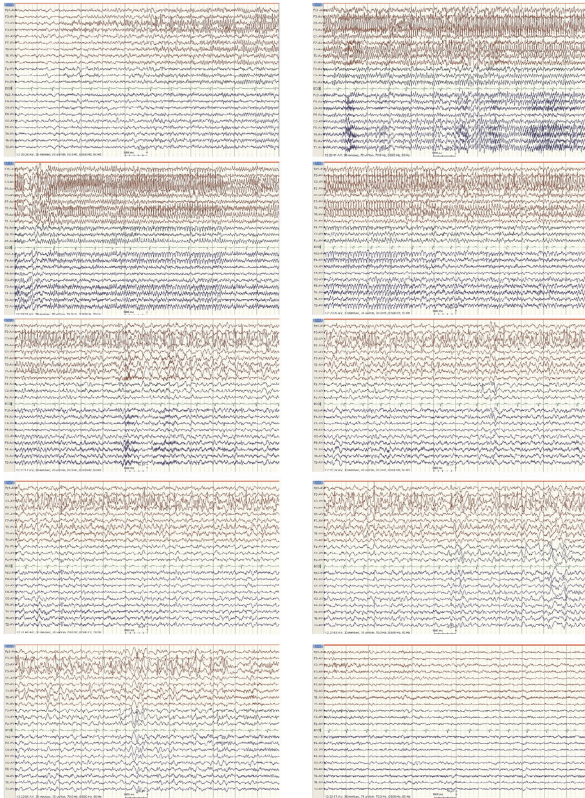
Figure 2. EEGs of the seizure ictal performed on the 27-year-old female patient upon the admission. The EEG revealed irregular spikes and slow wave delta activity in the left central and temporal regions, leading to a diagnosis of Broca's aphasia. EEG recorded the change of wave during the ictal phase. EEG, electroencephalogram.

multiforme. Racy et al (9) reported aphasia in a patient presenting with a cranial defect in their left parieto-occipital area. In the present case report, the patient had a traumatic lesion in their left parietal lobe.