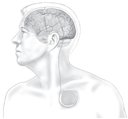
Figure 1. System diagram of deep brain stimulation. The stimulating electrode is implanted by stereotactic neurosurgery and connected to a subcutaneous pulse generator with a wire. This image is provided by David Peace from the Neurosurgery Department, School of Medicine, University of Florida. This image was adapted with permission from Holtzheimer and Mayberg (6).

The foundation of DBS research involves searching for the target region by theoretical derivation (28). The target chosen by theoretical derivation in mental disease therapy is derived from clinical experience, results from brain imaging and the pathophysiological knowledge of various diseases (29). Mental diseases typically do not result from simple pathological changes in a single brain structure, it is thought that certain brain structures may serve different roles in the progression of disease and its relative symptoms. Targets with similar anatomical structures or functional relationships (neural networks) may generate a superposition effect; therefore, different targets may be able to regulate the same pathological network on different nodes (30). It has been determined that the targets discussed below are able to remit psychosis symptoms (Fig. 3) (6).