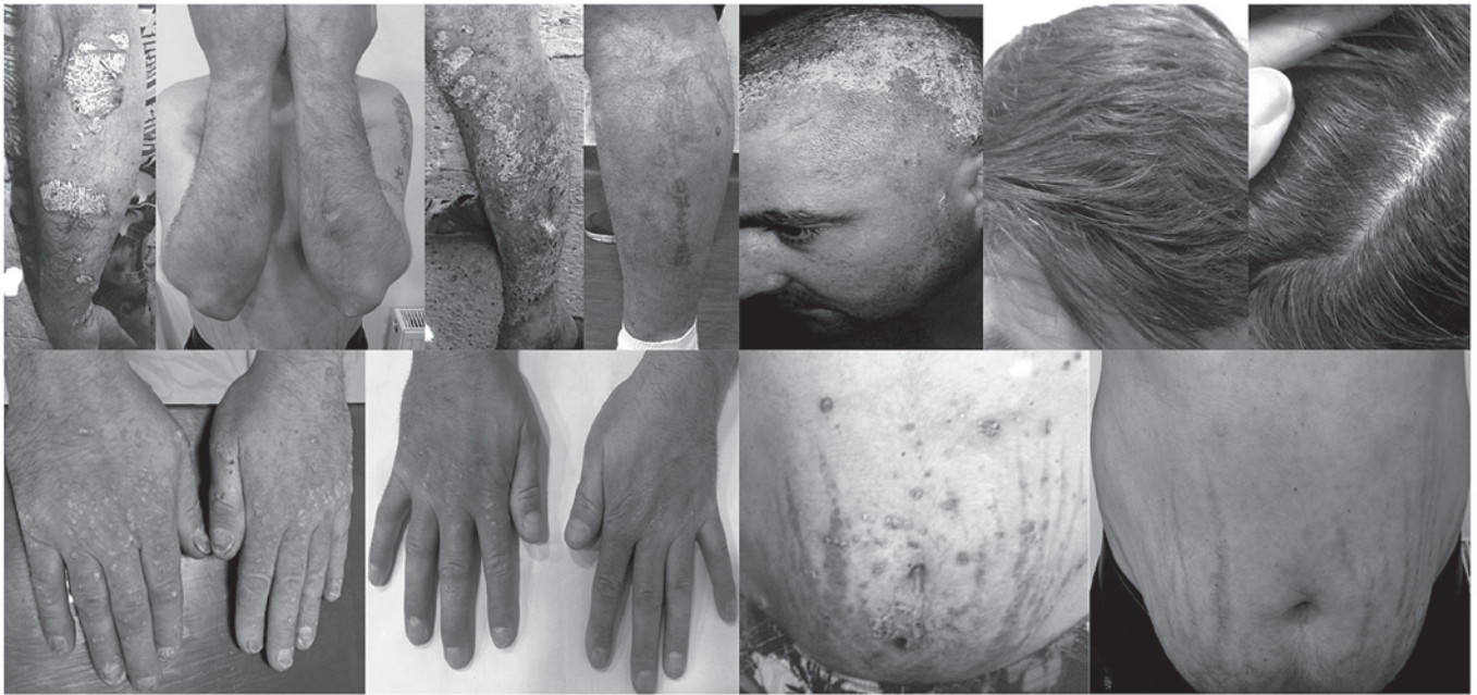
Figure 5. The evolution of psoriatic lesions.

Index (DLQI)=25], chronic HBV hepatitis with positive Ag HBe and overweight (BMI=29.4). The therapeutic algorithm included initiation of anti-TNF therapy with etanercept (2x50 mg/week) combined with entecavir, an antiviral treatment administered continuously since the diagnosis of the HBV hepatitis, with hepatic function and viral load monitoring. Patient reached PASI 75 at week 12 and registered significant improvement of DLQI (Fig. 4) and decrease of viral load (below the detection limit of 20 copies/ml), however, without changes in viral markers. After 3 months of therapy with etanercept the patient was given a dose of etanercept of 50 mg/week combined with entecavir 0.5 mg/day which he continued until week 36 when psoriatic lesions had cleared (PASI=0.6; DLQI=0). The patient had normal levels of ESR, CRP, including transaminases after the cure with MTX.