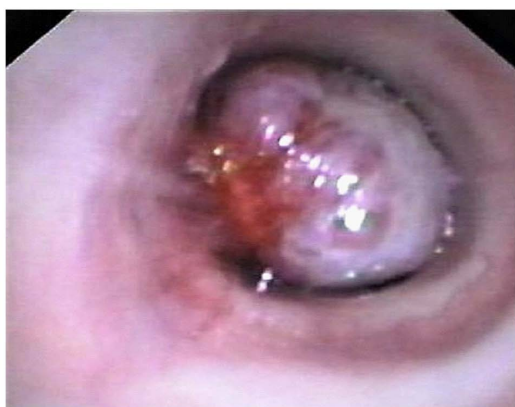
Figure 2. Bronchoscopic view of a carcinoid tumor in the left main bronchus.

Cushing syndrome was staged as IIb, but after surgery N1 was infirmed and the patient restaged to stage II a (T2bN0M0). The remaining cases of atypical carcinoid were staged as Ia and Ib.