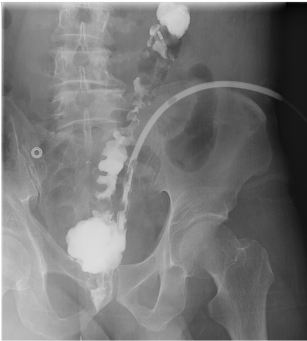
Figure 1. Fistulography showing the contrast agent injected through the drainage tube entering the intestinal tract.

Low rectal cancer, defined as distance from the anal verge \leq 7 cm, was identified in 35 patients (25.55%), including 3 cases of AL. Ultra-low rectal cancer, defined as distance from the anal verge \leq 5 cm, was identified in 13 patients (9.49%), including one case of AL. The median distance from the anastomosis to the anal verge was 6 cm (range, 2-14 cm). All patients had negative proximal and distal resection margins.