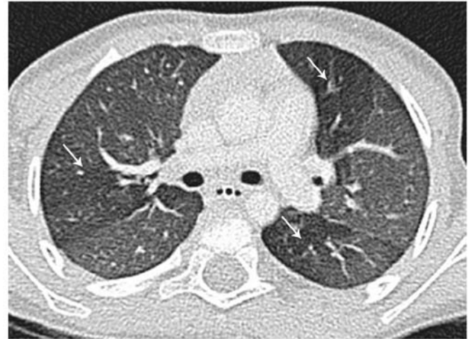
Figure 5. Same child; expiratory transverse thin-section CT scan through the same level as Fig. 4 reveals hyperlucent areas of air-trapping bilaterally (arrows). CT, computed tomography.