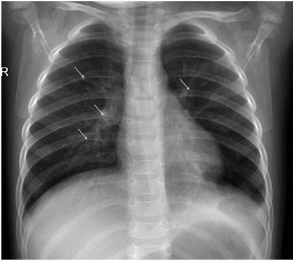
Figure 3. Chest radiograph of a 14-month-old girl admitted to hospital with RSV-positive ALRTI. There is hyperinflation of the lungs and presence of bronchial wall cuffing (arrows), without evidence of consolidation or effusion. RSV, respiratory syncytial virus; ALRTI, acute lower respiratory tract infection.