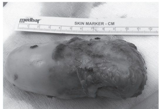
Figure 2. Macroscopic specimen of the appendiceal mucocele including the base of the appendix.