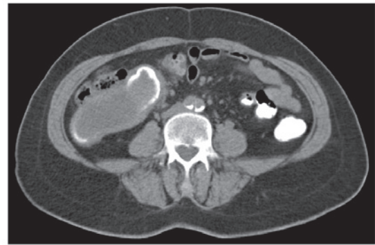
Figure 1. Computed tomography scan showing a retroperitoneal cystic mass with partial calcifications on the wall.

It is generally accepted that appendectomy is suitable for unruptured benign mucoceles localized to the appendix (1,11). There is no consensus on the surgical treatment for mucoceles involving the base of the appendix or invaginating into the caecum. Right hemicolectomy, ileocaecal resection and