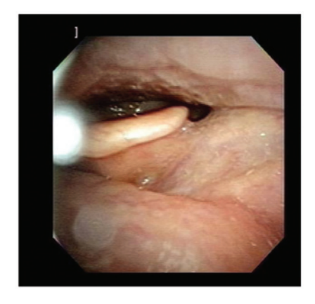
Figure 4. Following brachytherapy, the patient achieved complete remission according to the laryngoscopic examination.

of the Helsinki Declaration of 1975, as revised in 2008. The patient provided written informed consent and the clinical data were anonymized for statistical work-up.