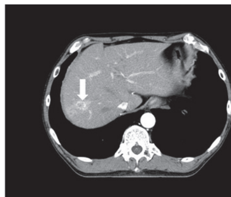
Figure 1. Contrast-enhanced CT scan of the abdomen in December 2013 showing a lesion measuring 18 mm in segment 8 of the liver (indicated by white arrow). CT, computed tomography.

However, the indication for SBRT in the management of oligometastases should be considered carefully. Although the