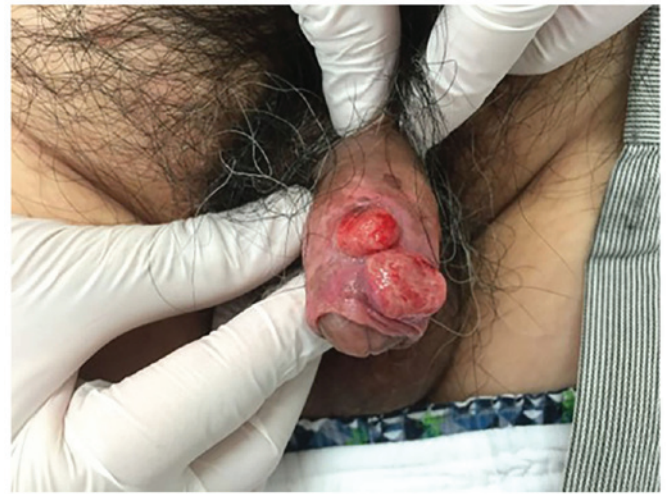
Figure 1. Macroscopic appearance of nodular malignant melanoma involving the penile foreskin.

The primary treatment of melanoma of the glans penis and urethra is surgery; however, the main area of controversy lies with the extent of surgery for localized disease (13). In