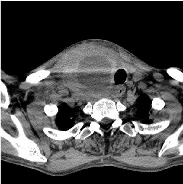
Figure 2. Computed tomography scan illustrating the lesion displacing the trachea and narrowing the caliber of the jugular vein in different cross-sections to show its extension.

within, as well as some septation and peripheral vascularity, suggesting a complicated cyst with bleeding/infection.