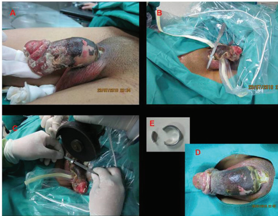
Figure 1. Penile strangulation and removal of steel hoop. (A) Patient with penis strangulation (duration, 5 days) caused by steel hoop on the base of the penis. (B) A metallic strip was placed between the hoop and the penis to protect the skin. (C) The steel hoop was cut with a motor-operated emery wheel machine. (D) Penis following removal and (E) the removed constricting object.