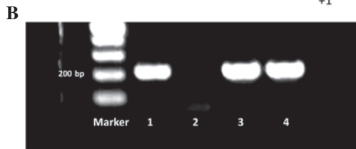
Figure 1. Sequence analysis of the survivin gene promoter. (A) DNA sequence analysis of the 5' flanking region of the human survivin gene. Numbering is from the translation initiation site ATG. The 207 bp PCR sequence is shown in bold and the putative bindings sites for Sp1 are underlined and numbered A-G. (B) Nested PCR of the survivin promoter. PCR products were separated on a 1.5% agarose gel stained with ethidium bromide and were observed under ultraviolet light. 1, 3 and 4 represent three samples which were subsequently sequenced. PCR, polymerase chain reaction; Sp, specificity protein.

A TCGAGGGGGCGCTAGGTGTGGGCAGGGACGAGCTGGC GCGGCGTCGCTGGGTGCACCGCGACCACGGGCAGAG CCACGCGGGCGGGAGGACTACAACCTCCCGGCACACCCC GCGCCGCCCCGCCTCTACTCCAGAAGGCCGCGGGGG GTGGACCGCCTAAGAGGGCGTGCCTCCCGACATGCC CCGCGGCGCGCCATTAACCGCCAGATTTGAATCGCGGG ACCCGTTGGCAGAGGTGGCGGCGGGC AT GGGTGCC +1