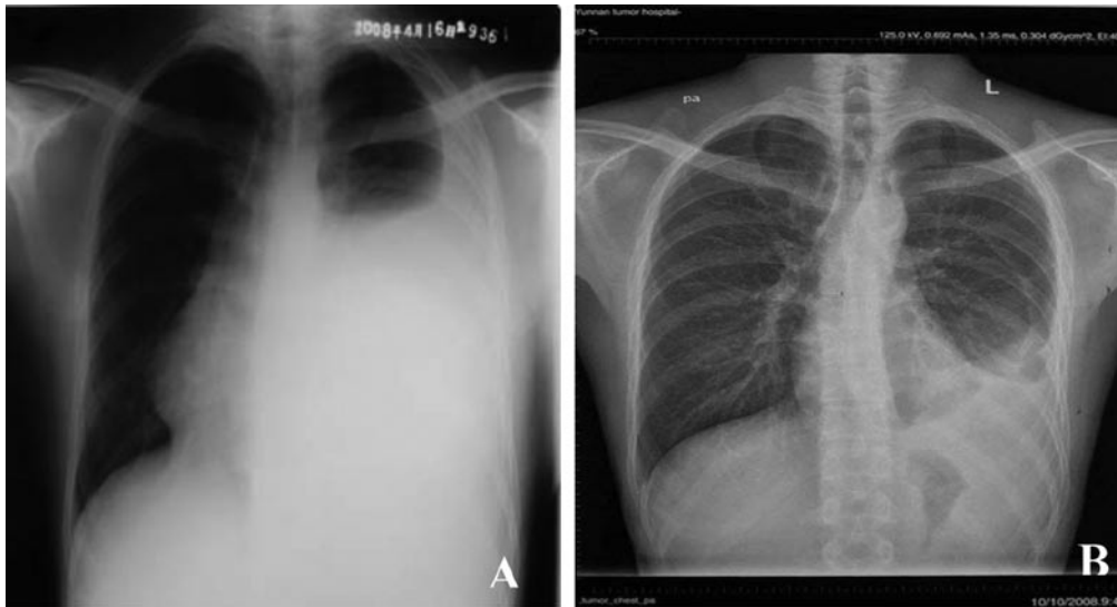
Figure 4. Alteration of chest X-Ray. (A) Pre-therapy reveals a large amount of pleural fluid in the left thoracic cavity. (B) After the third cycle of treatment, the level of pleural fluid decreased significantly.

this case due to the efficacy of this novel immunotherapy method in the suppression of pleural metastasis of CDC.