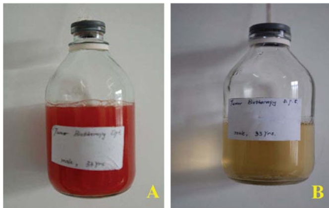
Figure 2. Pleural fluid change. (A) Pre-therapy: haematodes fluid. (B) Following the second treatment cycle: clear fluid.

to the patient through intrapleural infusion, following in vitro culture of the mCIK cells.