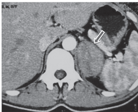
Figure 1. Abdominal computed tomography of the patient with primary adrenal nodular lymphocyte-predominant Hodgkin lymphoma. A soft tissue mass was observed in the left adrenal gland (arrow), measuring 4.5x5.5 cm, with a less uniform density and clear borders.

paired box protein 5, CD79a, octamer binding protein 2 and epithelial membrane antigen (EMA). Additionally, very few cells were positive for CD15. The tumor cells were surrounded by T cells, which were positive for CD3 and CD57 (Fig. 2). According to the immunohistochemistry results, the patient was diagnosed with primary adrenal NLPHL, stage IB according to the World Health Organization (WHO) (8).