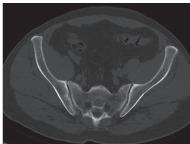
Figure 1. Computed tomography scan of the sacroiliac joints revealing bilateral erosion and sclerosis in the margin of the iliac side.

Leukemic arthritis (LA) is a major form of paraneoplastic rheumatic syndrome, which may be defined as joint pain and