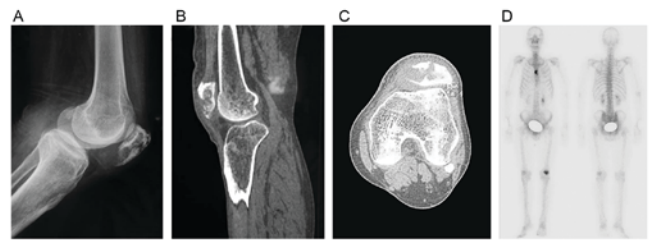
Figure 1. The imaging features of patellar metastases from lung carcinoma. (A) Radiograph and (B) computed tomography (CT) scan on the left patella revealed an osteolytic lesion. (C) Axial CT identified soft tissue swelling surrounded the lesion. Additionally, a [ 99m Tc]methylene diphosphate bone scintigraphy (D) indicated increased radioactivity in the pulmonary hilum and the left patella.

A patellectomy was performed followed by routine physiotherapy. Radiotherapy was used to target the internal mammary and mediastinum, with Prednisone supplemented. The knee pain was relieved and effusion was gradually aspirated. The general condition of 1 case deteriorated rapidly and the patient succumbed following a short period of time (31).