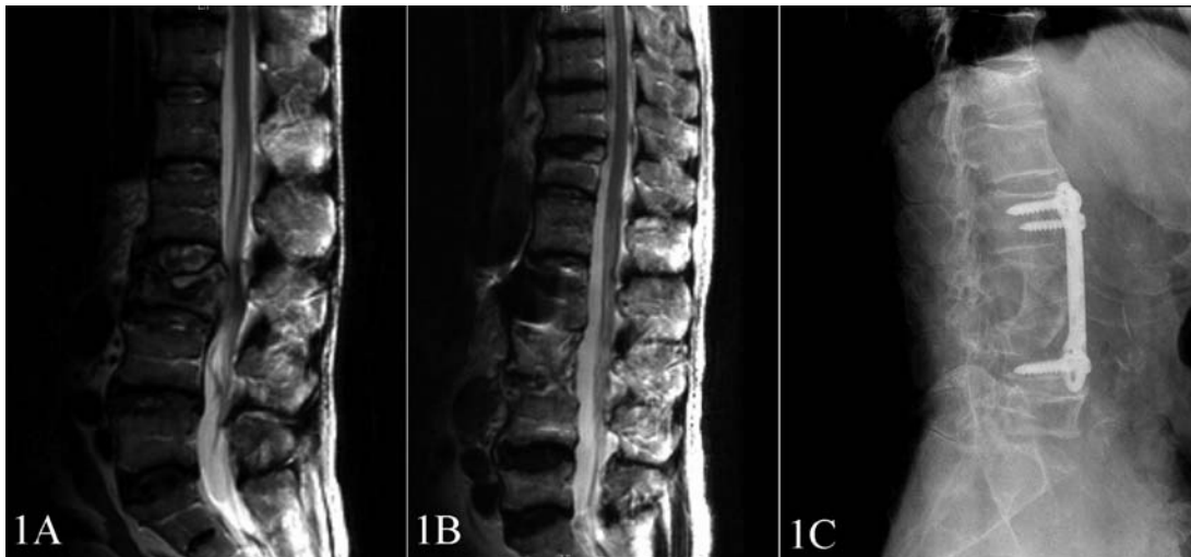
Figure 1. Results of primary non-Hodgkin's lymphoma of L3 treated by surgery and chemotherapy (case 5). (A) MRI views (T2-weighted) show the prominent fracture vertebra with soft tissue mass intruding the spinal canal and compressing the equina cauda. (B) MRI views (T2-weighted) show equina cauda is decompressed completely and no evidence of tumor exists 5 years after treatment. (C) Radiogram shows bone fuse and no evidence of tumor exists 5 years after treatment.