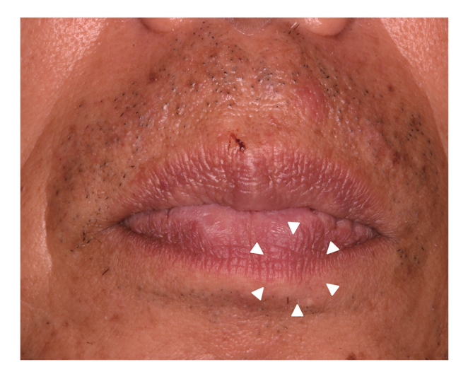
Figure S1. Postoperative follow-up image. The patient appeared to have healed uneventfully (white arrowheads).